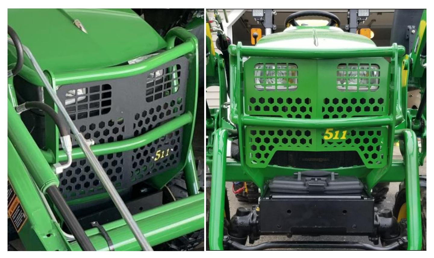
Completed installation 1025R